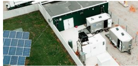
In-Field Demo Project