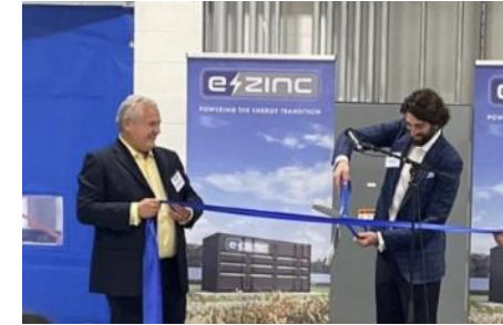
New production facility (Canada)