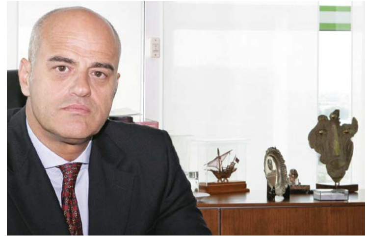
Claudio Descalzi - Eni's CEO

It was his firm conviction that dialogue and respect for cultures constitute the cornerstones for long term partnerships and mutual growth. From a perspective of sixty years, it is possible to see that Mattei's values have endured and his philosophy still forms part of Eni's corporate philosophy. His guiding principles are today captured in the modern concept of sustainable development.