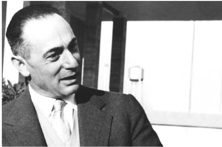
Enrico Mattei - Eni's Chairman in 1953